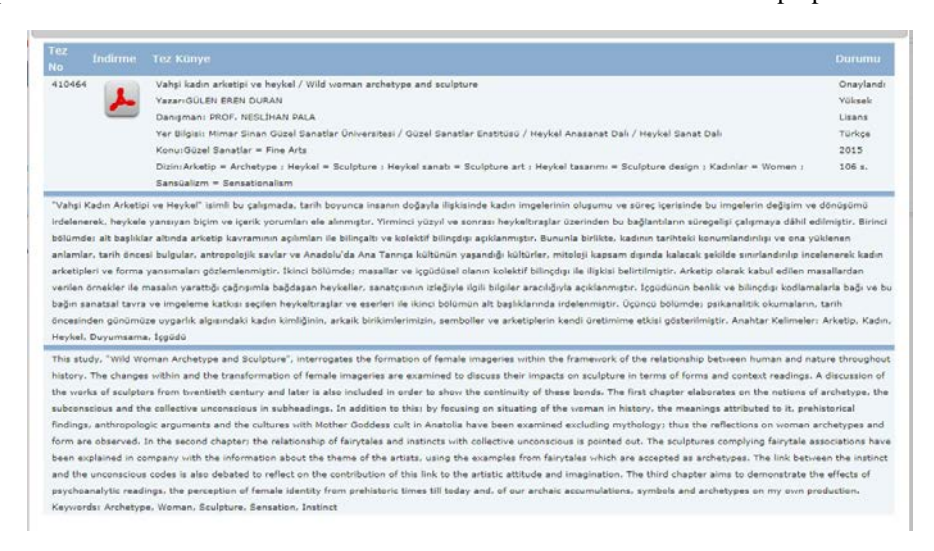
Figure 1: Gülen Eren Duran's Thesis Abstract and Other Information

In this section of the study 5 theses were examined considering their contexts. All the thesis were gathered from Council of Higher Education Thesis Center. Departments were considered in the theses selection and painting and sculpture departments' theses were chosen. After examination of the theses a chart is prepared.